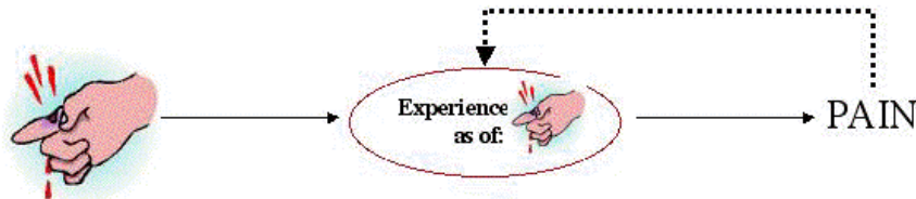
FIGURE 1: Asymmetry in concept application despite identical information flow.

Intransitive Bodily Sensations (e.g., pain):